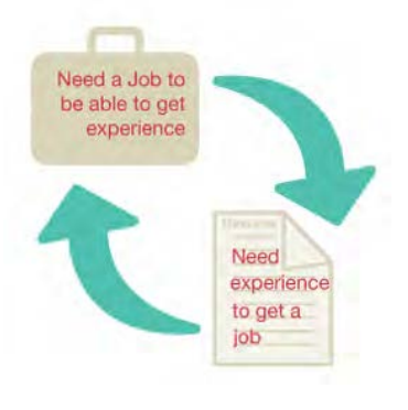
'The work-experience cycle'

For more information on this report, please Click Here