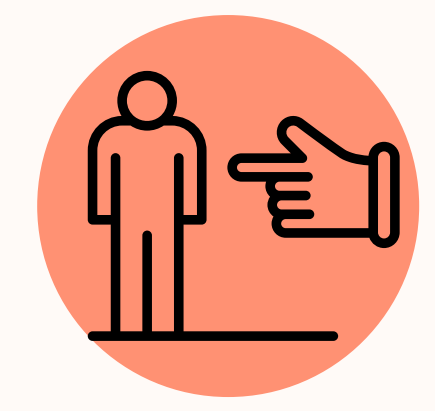
Mental health services should focus on ongoing systemic and institutionalised racism CaLD people face.