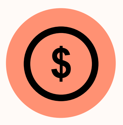
Service providers need to be more accessible and affordable.